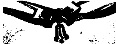
A Christmas Parade